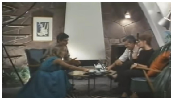
Photogram of "Últimas tardes con Teresa", showing the interior of one of the apartments in the attic of La Pedrera