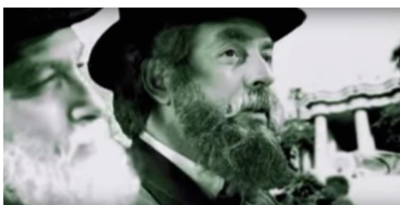
Photogram of "Güell i Gaudí, un projecte comú", by Joan Riedweg

In its 20 minutes of duration this film shot in Catalan narrates some conversations between Eusebi Güell and Gaudí, performed by Abel Folk and Ramon Madaula respectively. The action takes place during some carriage rides in four different stages of the relationship between these two great characters.