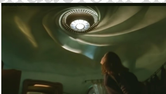
Photogram of "Casper" showing the reproduction of the ceiling of the living room of Casa Batlló

In this house many of its rooms literally reproduce elements of Gaudí's works: Windows and doors and the spiral ceiling of Casa Batlló, carpentry of La Pedrera and columns inspired by Palau Güell and Casa Calvet, as well as parabolic arches reminiscent of Teresian College.