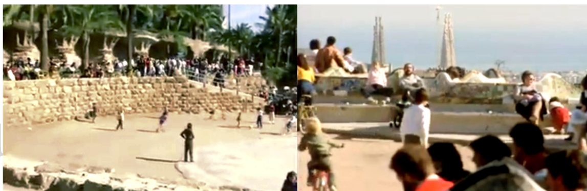
Photograms of "Antoni Gaudí", by Hiroshi Teshigahara

Shot in 1961 by director Ken Russell for a series of 21 BBC documentaries about art. His interest lies in being the